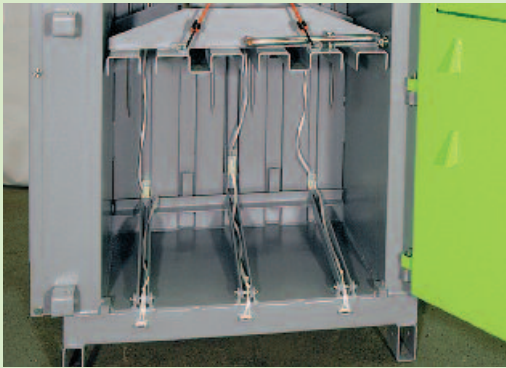
Press plunger and ejector