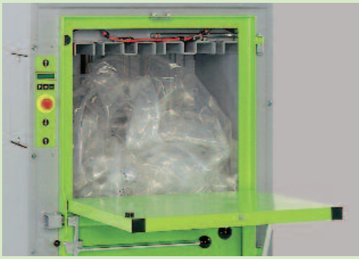
Pressing of foil material